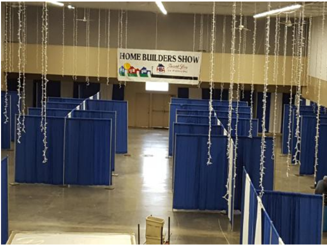
We started the Show with the Curtains Up!