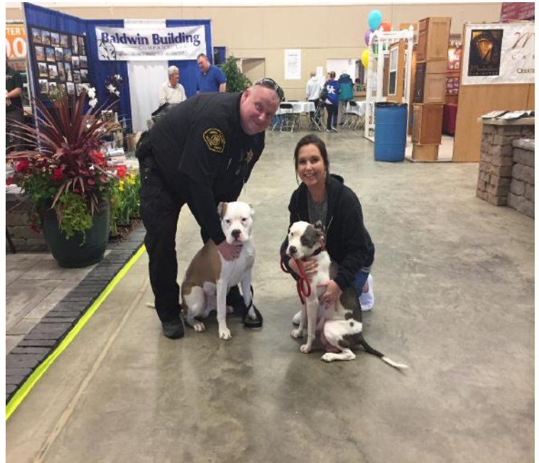
Our four legged friends from the Cascades Humane Society