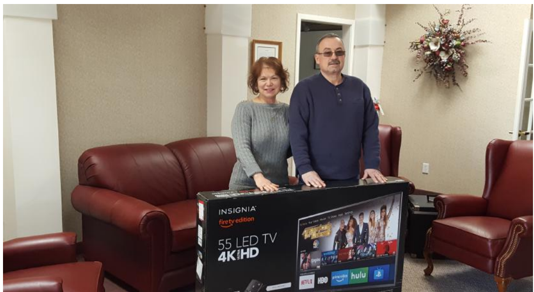
And the winners of the 55 inch T.V.