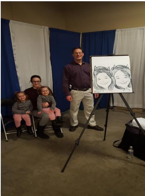
The "Nose" Caricaturist drawing a family at the Home Show.